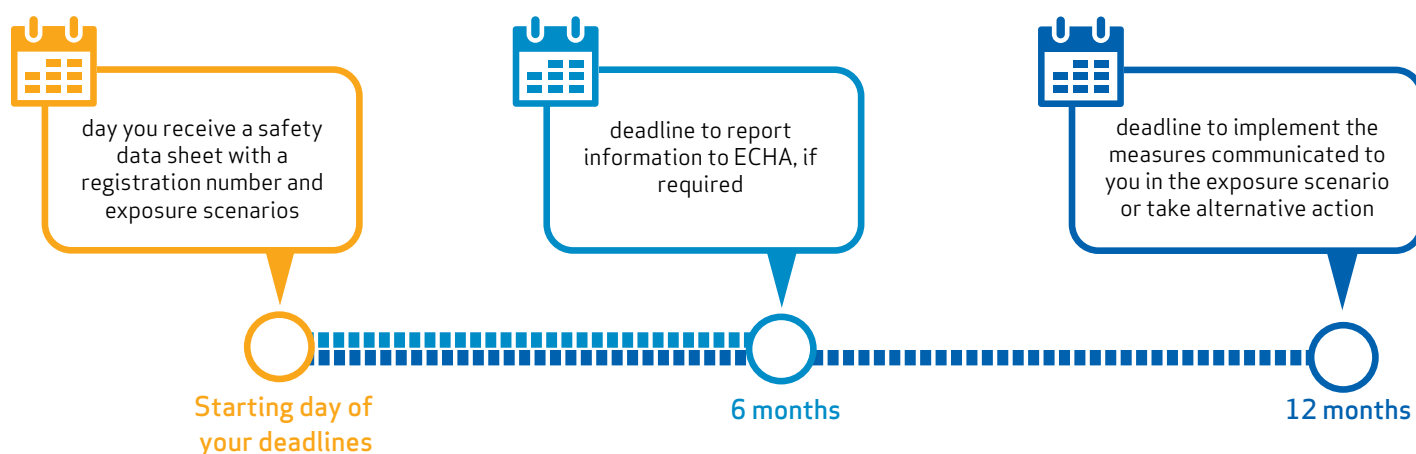
Figure 1: REACH timelines for implementing downstream user obligations

» https://echa.europa.eu/practical-guides